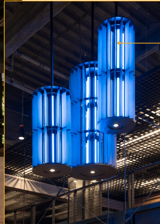
RGBW LED + DMX CONTROLS